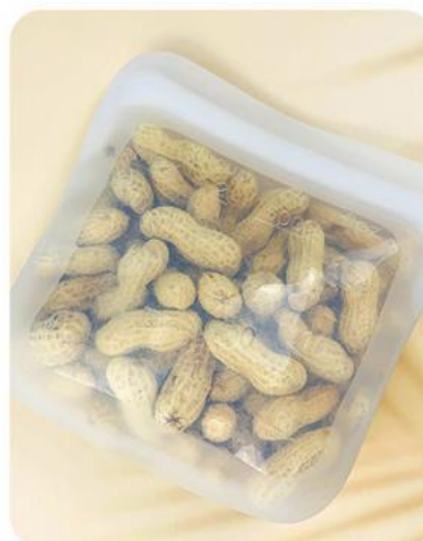
Nuts are not susceptible to moisture