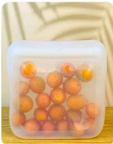
Fruits are not perishable