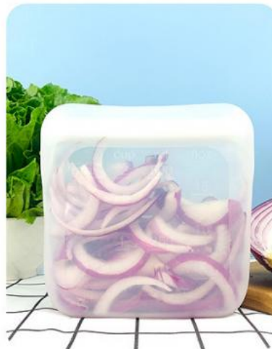
Vegetarian dishes are not easy to spoil